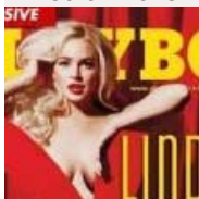
Playboy spread of Lindsay Lohan online, photos