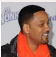
Will Smith called an a**hole by former co-star