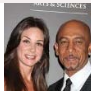
MS survival tips: Montel Williams on The Dr. Oz Show Jan. 3